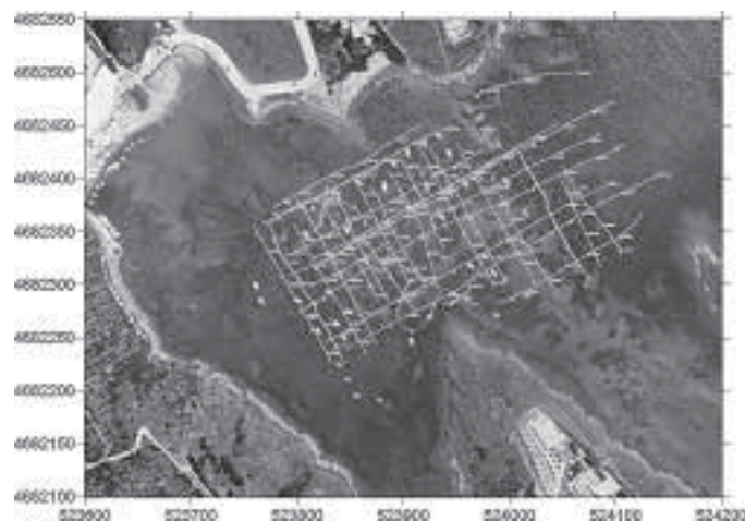
Figure 1: Navigation tracks of the seismo-acoustic records acquired in Port Lligat Bay during the Carbomed Project. Track in red: profile 71 (Fig. 2). Track in yellow: profile 8 (Fig. 3). Red dot: core site

The distribution of the Mediterranean seagrass Posidonia oceanica has been widely assessed using acoustic methodologies. However, informations on P. oceanica internal structure obtained with seismic methods are still very rare. In the framework of the multidisciplinary project CARBOMED (Proyecto Intramural de Frontera, PIF-2005, CSIC, Ref. 200530F0232), a seismo-acoustic survey was carried out in Port Lligat Bay (Catalonia, NE Spain) with the aim to assess the volume potentially occupied by P. oceanica organic deposits (known as "matte"), detect its internal structure and highlight the morphological and sedimentological characters of the study area (Fig. 1). A first calculation of the potential volume of P. oceanica deposits in Port Lligat Bay was estimated in about 175.000 m 3 [1].