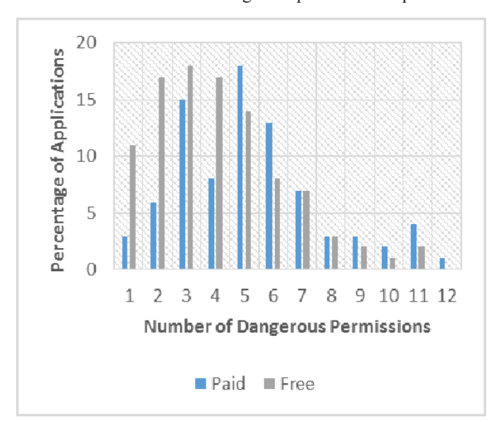
Fig 3. Dangerous permissions per application

Analysis of updates: The success of a privilege escalation attack on an update process depends not only on the presence of Pileup vulnerabilities, but also on the new system resources and capabilities the update adds that can be acquired by the adversary through the attack. Here we present a measurement study in which we ran our PermisSecure against a large number of applications for updates (183 Apps) to understand the exploit opportunities (new exploitable attributes and properties) they bring in.