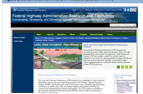
Figure 2. Screen shot from the LTPP Website

The Long Term Pavement Performance Database (LTPP, Figure 2.) constitutes one of the most important strengths of this method. It is the best data source of the field behavior of practically all the existing types of pavements under different load conditions, with different subgrades and foundations and in very diverse climatic zones. It has been created from general pavement studies (GPS), but also from specific pavement studies (SPS), expressly built to obtain some kind of information. Their combination allows the user to rely on data of more than 2,500 test sections, which are periodically updated and revised (Momin, 2011). Despite the power of this database, the accuracy of the results depends on the possibility of obtaining precise additional information of the construction area.