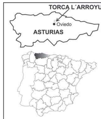
Fig. 1.- Geographical location of Torca l'Arroyu.

of the Tertiary of the Basin of Oviedo; then, the river gets into the Carboniferous limestones of the Naranco hill, more towards the W. The cave is located in the slope of the right side of the Nora river,