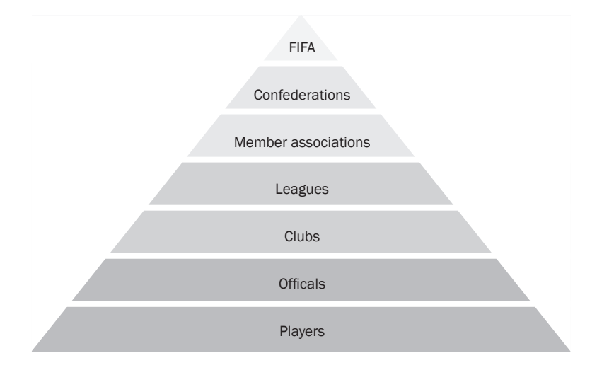
FIGURE 1 Hierarchy of FIFA's governing bodies

At the top of the FIFA pyramid of control lie its Congress,<sup>124</sup> Council,<sup>125</sup> General Secretariat,<sup>126</sup> and various standing and ad hoc committees.<sup>127</sup> Next, there are the six FIFA confederations, which consist of regional groupings of the 211 FIFA-recognized national membership associations.<sup>128</sup> In exchange for financial and logistical support from FIFA, these associations are required to abide by the FIFA Statutes and relevant rulings of the Court of Arbitration for Sport (CAS).<sup>129</sup> Within