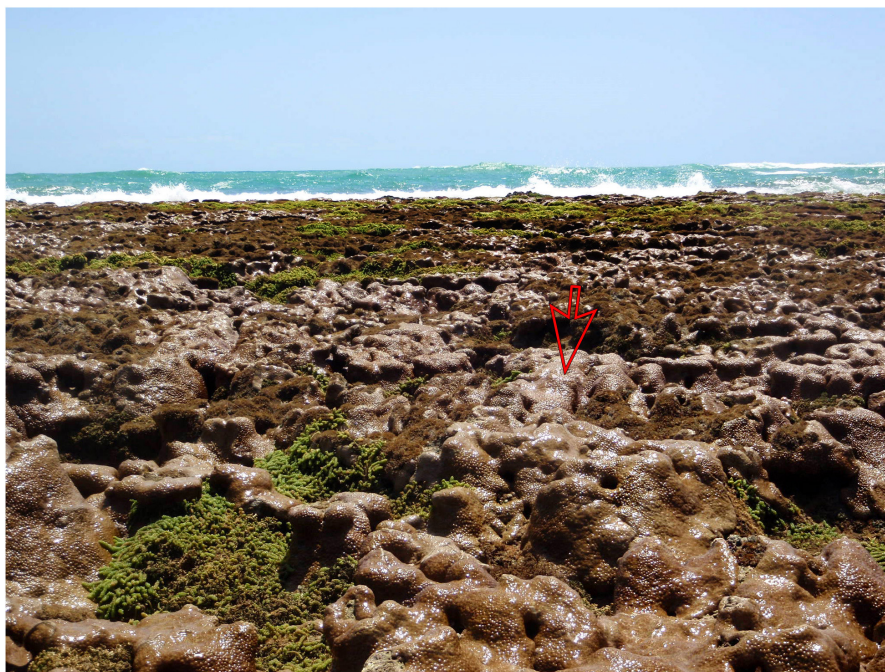
Figure 1. Exposed colonies of Palythoa caribaeorum (red arrow) growing on the Porto de Galinhas reefs, Pernambuco, Brazil / Colonias expuestas de Palythoa caribaeorum (flecha roja) creciendo en los arrecifes de Porto de Galinhas, Pernambuco, Brasil

After quantification using Qubit Kit (Invitrogen), the quality was confirmed by 1% agarose gel electrophoresis, 25 ng of DNA from each sample was employed for the partial 16S rRNA gene amplification by using the primers 27F (5'AGA GTT TGA TCM TGG CTC AG) and 1492R (5'TAC GCY TAC CTT GTT ACG ACT T). The 50 µL reactions included 5 µL of DNA template, 5 µL (20 pmol µL -1 ) of each primer (forward and reverse), 5 µL of dNTP's, 5 µL of PCR buffer, 0.1 units of Taq DNA polymerase (Fermentas®) and 22 µL of ultrapure water. The reaction cycles were: 94 °C (5 min), 30 cycles at 94 °C (1 min), 62 °C (1 min) and 72 °C (3 min), followed by an extension step at 72 °C (10 min). Amplification success was verified by electrophoresis in 1% agarose gel, stained with GelRed at a 1:10,000 dilution and the products were purified using QIAquick PCR Purification kit (QIAGEN®). Purified products were quantified in a spectrophotometer Thermo Fisher Scientific® and diluted to a final concentration of 100 ng µL -1 , for the sequencing reactions.