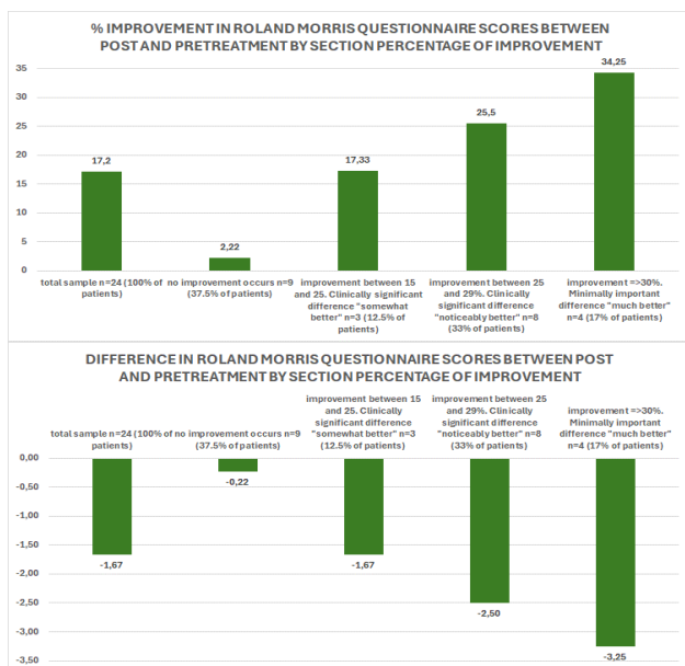
Figure 1. Percentage improvement and difference in Roland Morris questionnaire scores between post- and pre-treatment by percentage improvement range

Results by pre-treatment Roland Morris disability level range, classifying participants according to the observed disability level range. In the first range, where the disability level was equal to or less than 6, a total of 7 patients were found, with a mean difference of -0.143 (SD = 0.378) between pre-and post-treatment scores, and an average percentage improvement of 2.429% (SD = 6.425), with a range of improvement between 0% and 17%. In the following range, with disability levels greater than 6 but equal to or less than 10, 9 patients were identified, with a mean difference of -2.000 (SD = 1.000), and an average percentage improvement of 25.222% (SD = 12.070), with a range of improvement between 0% and 38%. Finally, in the range where the disability level exceeded 10, 8 patients were located, with a mean difference of -2.625 (SD = 1.061), and an average percentage improvement of 21.125% (SD = 7.220), with a range of improvement between 9% and 33% (Table 5).