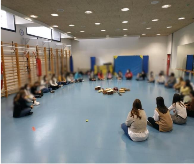
The Instruments activity

Note. Source: Own work (100:1 - PR. 2, S. 2)