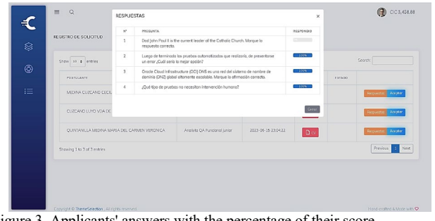
Figure 3. Applicants' answers with the percentage of their score.

Fig. 3 shows the answers of the applicants with the percentage of their score, showing the most outstanding qualities of the applicants.