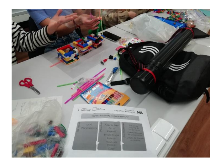
Fig. 4: Simulation working corner for the horizontal underground sewerage network.

work they need and to encourage peer learning, three large groupings are created in the classroom, like corners. In each of them, students are arranged to work on regulations, plans and construction general details. respectively. Likewise, a space is left near the staff. called simulation. teaching where catalogues, books and construction parts are made available to students so that they can conduct the consultations and evaluates they need. Occasionally, the professors proposal some materials for the assembly some construction systems (Fig. 4)