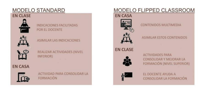
Fig. 1: Diagram of the standard teaching model compared to the flipped classroom model (Source: Rizzo [et.al.], 2015).

Flipped Learning follows a model whereby students consult and study the contents before attending class, so that during the sessions they can assimilate and understand them through activities guided by the teachers (Fig. 1). In this way, the brain is encouraged to transform the content (what is taught) into knowledge (what is learned) [14].