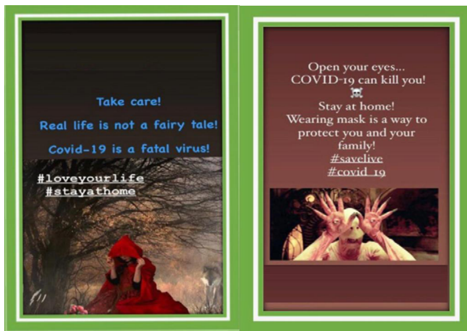
Figure 2 – COVID-19 Awareness Posters 2