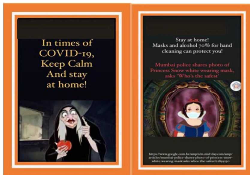
Figure 1 – COVID-19 Awareness Posters 1