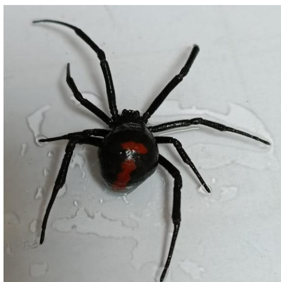
Figure 1 Female specimen of genus Latrodectus

According to the dichotomous keys 10 , the taxonomic evaluation criteria for specimens of the genus Latrodectus belong to the family Theridiidae. In their morphological characteristics it was recognised that they have black cephalothorax, abdomen and legs.