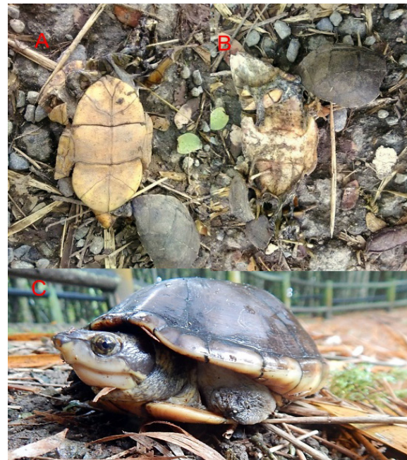
Figure 3. A, B. Remains (carapace and plastron) of Kinosternon leucostomum postinguinale in a secondary road of Vereda La Palmita, in the municipality of La Tebaida, Quindío. C. individual of Kinosternon leucostomum postinguinale with a left upper limb mutilation; Cajones creek, Montenegro, Quindío.

LOZANO et al. , 2017). In this work, we evidenced that K. l. postinguinale inhabits in pastures, possibly searching for ponds, a behavior already documented for this species (RUEDA-ALMONACID et al. , 2007; GIRALDO et al. , 2013). It was also found in secondary roads, where we observed individuals that were possibly ran over by vehicles (Figure 3 A, B), and in low-flow primary type streams and in wetlands associated with watercourses. Seven captured individuals of K. l. postinguinale had mutilated limbs (Figure 3 C), possibly due to interactions with other medium vertebrates, such as Lontra longicaudis and Chelydra acutirostris , both predators recognized in the area of La Vieja basin (BOTERO-BOTERO et al. , 2016; YOUNG-VALENCIA et al. , 2017; ARANGO-LOZANO et al. , 2017), and also, by interaction with terrestrial predators.