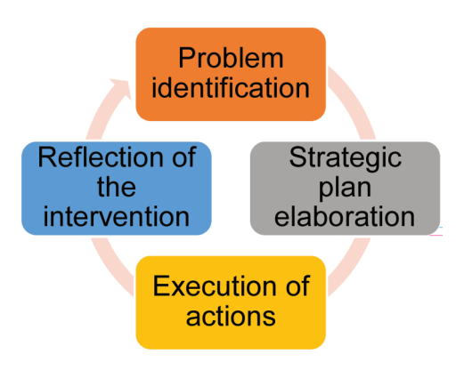
Figure 1 Representation of the action research process conducted