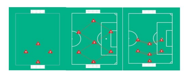
Figure 1. 4v4 formation, 7v7 attacking formation and 7v7 defending formation (PSSI, 2017) \,