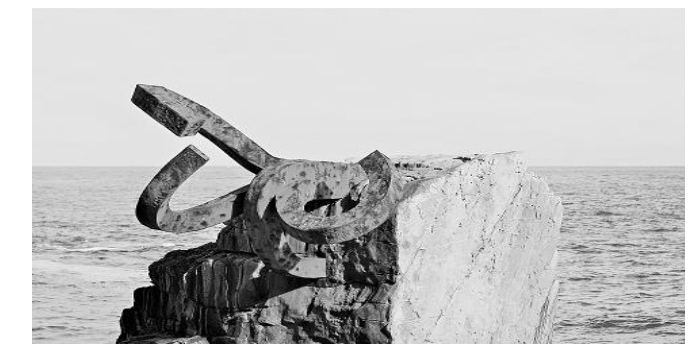
Fig. 1: Images of the three metal pieces that comprise the Peine del Viento.

Advances in Building Education / Innovación Educativa en Edificación | ISSN: 2530-7940 | http://polired.upm.es/index.php/abe | Cod. 2102 | Mayo - Agosto 2021 | Vol. 5 Nº 2 | pp. 23/31 |