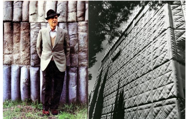
Fig. 2: Miguel Fisac photographed in front of one of his fabric formwork walls, and Miguel Fisac's first project using that technique: the MUPAG building in Madrid, 1969

Fisac became a renowned architect in Spain in the 1940s and 1950s and developed innovative structural uses of concrete since the beginning of the 1960s. However, at the very end of that decade, Fisac started to experiment with concrete in a different way: "I thought, in the end, after studying it in detail that, perhaps, the most distinctive characteristic, the most exclusive one of concrete is that it is the only material that arrives at the site, or to its prior fabrication, in a doughy state, which then solidifies. So, I thought that possibly its most genuine artistic impression might be of that of recording, like a genetic print, that it had been a soft material, poured into a mould. And as a characteristic of this doughy, soft state, it should not have sharp edges and should present a rounded aspect, typical of all soft materials." [3]