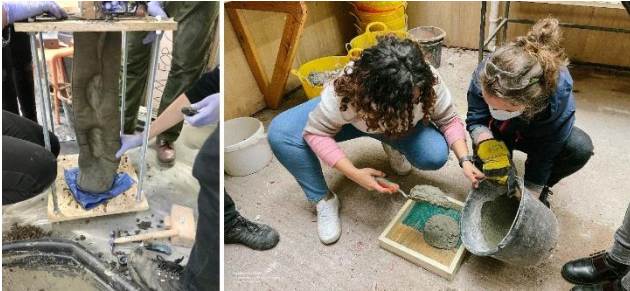
Fig. 1: Newcastle University Master of Architecture studios

engineering, the first person to truly acknowledge the architectural and aesthetic possibilities of fabric formwork beyond the mere utilitarian applications was the Spanish architect Miguel Fisac (1913-2006) [2].