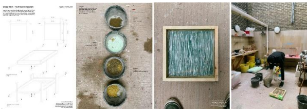
Fig. 5: Studio B working methods (from left to right): drawing showing the design of the timber rigs for the panels; concrete mixes with varying components and colour pigmentations; fabric formwork including plastic, reeds, and grasses; pouring the concrete mixes into the formwork

A standard Portland type I cement was used, together with different types of sand and fine aggregates. Students experimented with different mix ratios, such as 1:2 cement: coarse sand; 1:2:1.5 cement: fine sand: Styrofoam; 1:2:1.5 cement: fine sand: aggregate; 1:2 cement: fine sand.