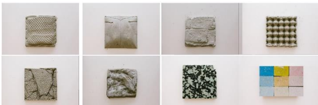
Fig. 7: Some of the concrete panels produced by Studio B

In a similar way to what happened to studio A's columns, some of studio B's concrete panels offered more successful results than others, in some cases influenced by the type of thematic research developed by students. For example, the panels produced by the group studying Material Re-use investigated re-using locally sourced materials for concrete formwork. In doing so, students manufactured a variety of panels using materials such as denim and jute bags for formwork. These resulted in very detailed textural qualities being imbued onto the concrete. This group was formed of students who found their projects were situated in incredibly urban settings where the sorts of materials used as form work could be found in abundance.