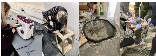
Fig. 4: Studio A working methods (from left to right): stitching the fabric formwork with a sewing machine; fabricating the timber rigs; mixing the concrete on a tray; pouring the concrete into the fabric formwork clamped to the rig

Nine students took part in studio A, working on different casting exercises for a period of four consecutive weeks. A regular pattern of work was followed, involving the preparation of the fabric formworks and casting of the columns taking place on Mondays, and the striking and evaluation of the results on Thursdays, leaving about 72h for curing.