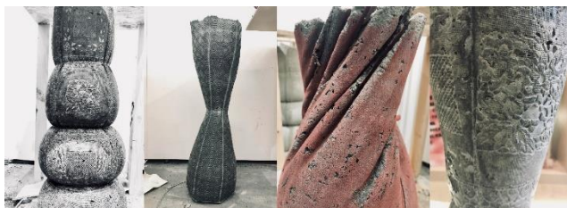
Fig. 6: Some of the concrete columns produced by Studio A

Another four columns were casted during the second week, using four other fabrics. Experiment 1 (linen fabric with chicken wire) produced an unsuccessful column. Although the concrete mix was sufficiently wet, the fabric did not bulge through the wire as expected. The mixture had not been compacted sufficiently, and the wire had far too small holes, which did not allow the concrete to penetrate properly. In experiment 2 (plastic sheet with rope), the writing on the plastic formwork printed onto the concrete very clearly. However, the column showed two different strains as the concrete mix had not been compacted enough.