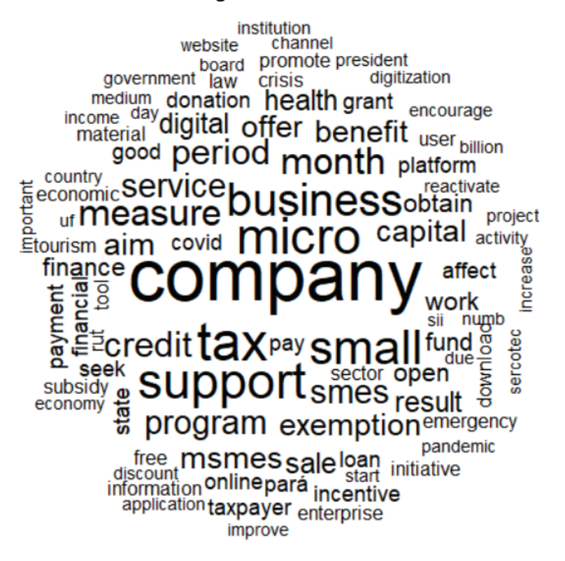
Figure 3. Wordcloud

free advice to entrepreneurs and MSEs. In addition, offering free courses on the web aims to increase skills to start a business and improve its management to achieve the best results. From these results and discussions, the keywords about incentives for MSEs were related, and it was possible to group the words and organize them graphically, by word clouds, according to their frequency in figure 3.