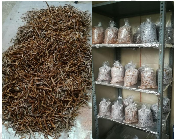
Figure 1: Compost materials and bags.

Wood sawdust was sterilized in an autoclave at 121 °C for 30 minutes to inactive detrimental organisms. After the cooling period (25 °C), the composts were prepared with 96 % wood sawdust, 3 % mycelium, and 1 % calcitic lime for pH balance in 29 cm x 45 cm bags - 4 as 1 kg for each variation as seen Figure 1 (Estrada et al. 2009, Yılmaz et al. 2017b).