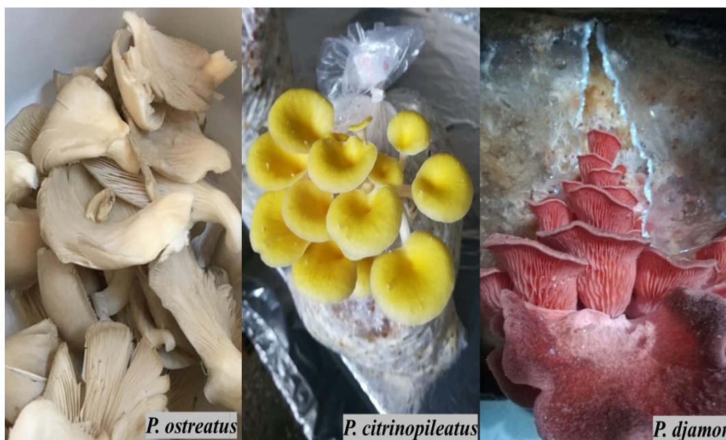
Figure 2: Cultivated mushrooms.

pouches were perforated to encourage mushroom development. The oyster mushrooms were harvested with a knife when they reached the same size (Figure 2).