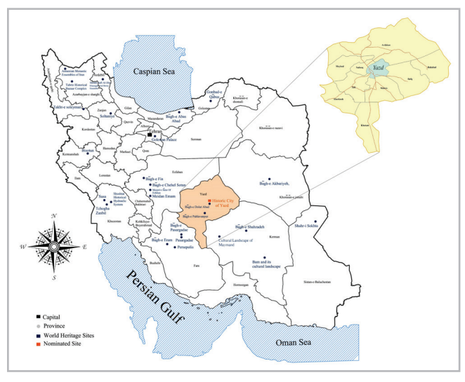
Figure 1.- Location of Yazd province in Iran.

The province of Yazd [Figure 1] is situated near the Silk and Spice Roads in Iran's center. It is evidence of how scarce resources were used to survive in the desert. The cultural heritage of Yazd has hardly changed over the years. At the 41st session of the UNESCO World Heritage Committee, held in Kraków, Poland, from 2–12 July 2017, the historic city of Yazd [Figure 2], which covers an area of 195 hectares, was inscribed as a World Heritage Site. Prior to this, Dolat Abad Garden and Zarch Qanat in the historic city of Yazd were also inscribed in 2011 and 2016, respectively (UNESCO 2023).