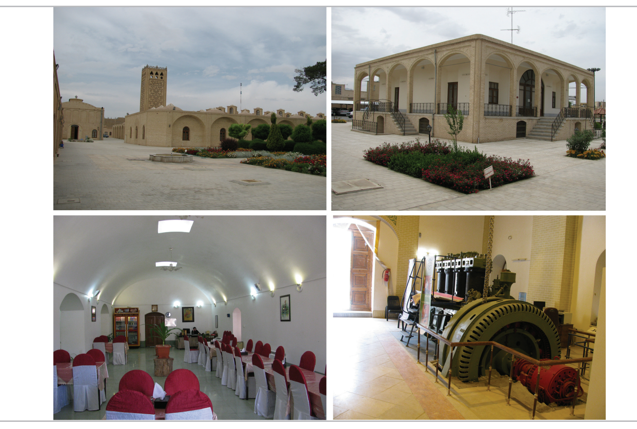
Figure 3.- Exterior and interior view of Eghbal factory, Yazd

Following the approval of the government in 2003, Eghbal factory [Figure 3] was handed over to the Science and Technology Park of Yazd province to set up a technology center. Considering the need to preserve this valuable textile manufacturing heritage site as the first factory in Yazd, an attempt has been made to restore and revitalize it, while preserving its structure and traditional identity, to turn this complex into a center of science and technology. Based on this, with the help of qualified consultants, the design of the site was carried out and the restoration activities started at the beginning of 2004 and were completed in 2008. The Jonub factory [Figure 4] consisted of different parts, and its private guest house became the museum of light and illumination in 1998 (Pahlevanzadeh 2015). Also, in 2017, a part of the spinning hall of this factory