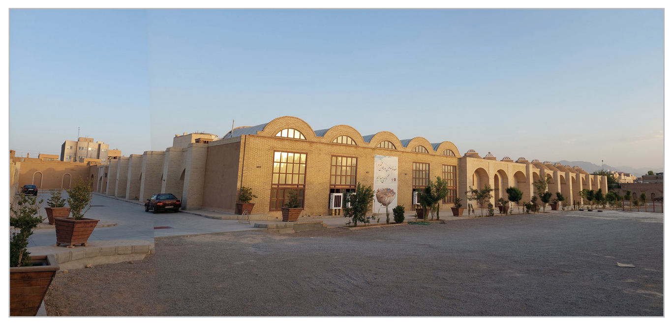
Figure 5.- Exterior view of Dorakhshan factory, Yazd © Mohammadhossein Dehghan Pour Farashah.

by entrepreneurs, from infrastructure, mentors, and advisors to venture capital investors, accelerators, and service providers, are granted to startups and businesses. The idea of setting up innovation factories in abandoned sites in the heart of cities was a solution that worked for the first time in Paris in 2019. When the French transformed the old Paris railway station into a dynamic space for the development of innovation ecosystems and start-ups, this idea soon found