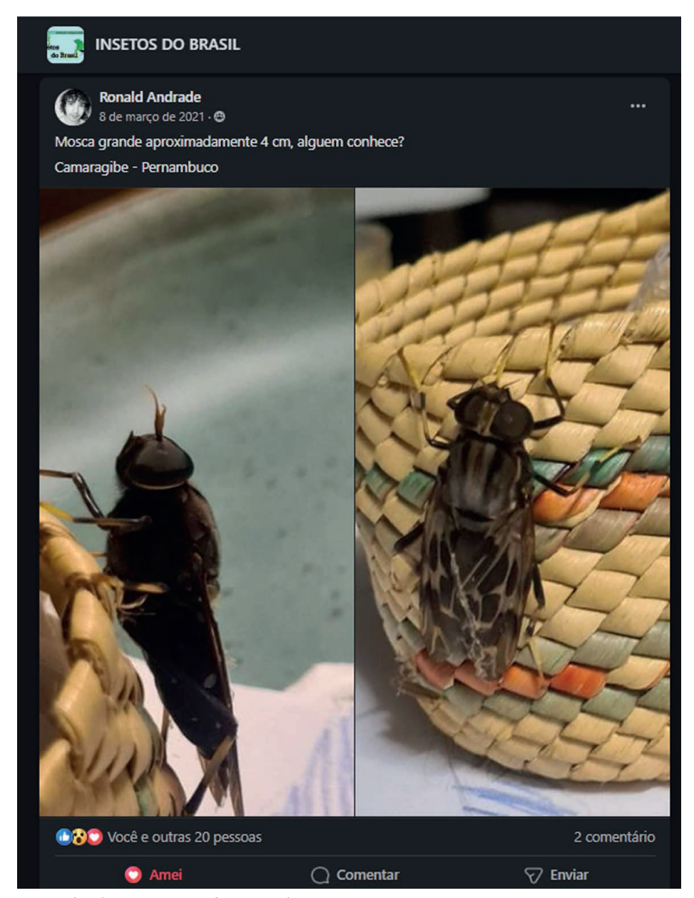
Annex I. Original post on Facebook group Insects from Brazil.