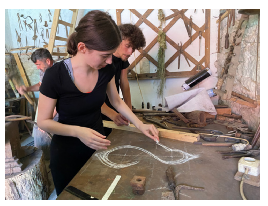
A volunteer drawing tie plates based on the shape of the storks to be seen in these parts, Braşov county, 2022

The most common bond for brickwork is of the English type, and a random rubble or roughly squared Scotch bond is used for stone walls. Most such masonry is built with simple clay mortar, but major medieval buildings were built in early stages with lime mortar. In some areas, as foundation for wooden churches one finds a base of dry limestone. In some projects the workshop starts with primary stonework, from extraction in the pit to splitting. This depends on the time and craftsmen available.