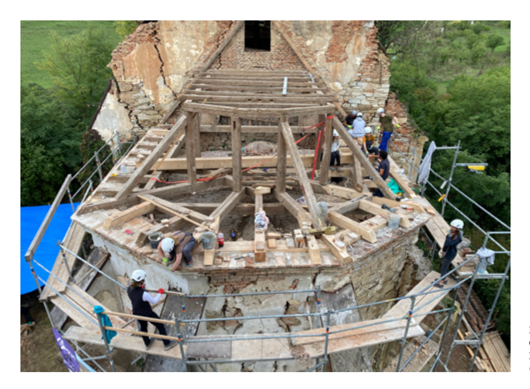
Roof structure at the Evangelical Church of Vermeş during restoration, Bistrița county, 2022 (Petrus Italus Trust)