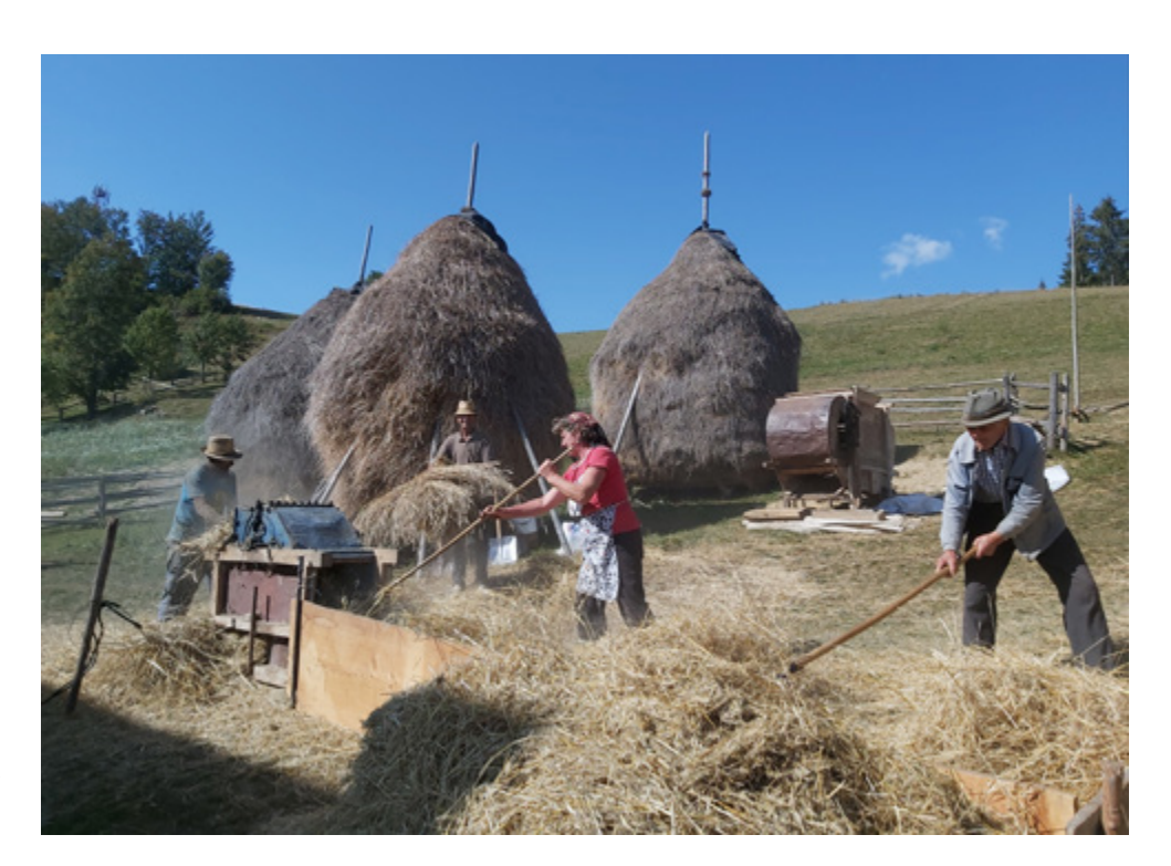
Threshing rye straw following manual collection in Arieşeni, Alba county, 2021 (Asociația Monumentum)