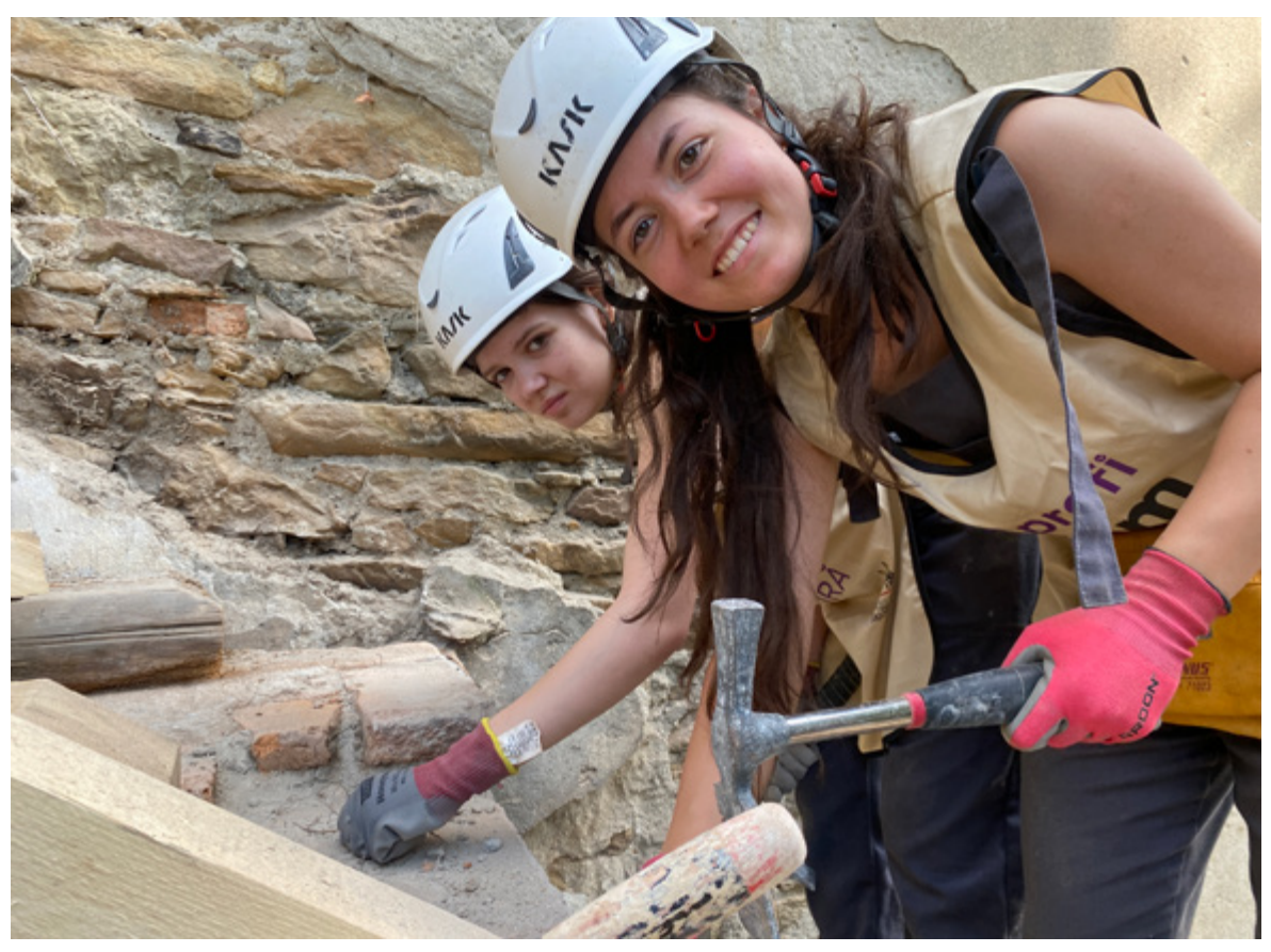
Repairing the rafters for laths mounting at the Evangelical Church in Hogilag, 2022 (Asociația Monumentum)