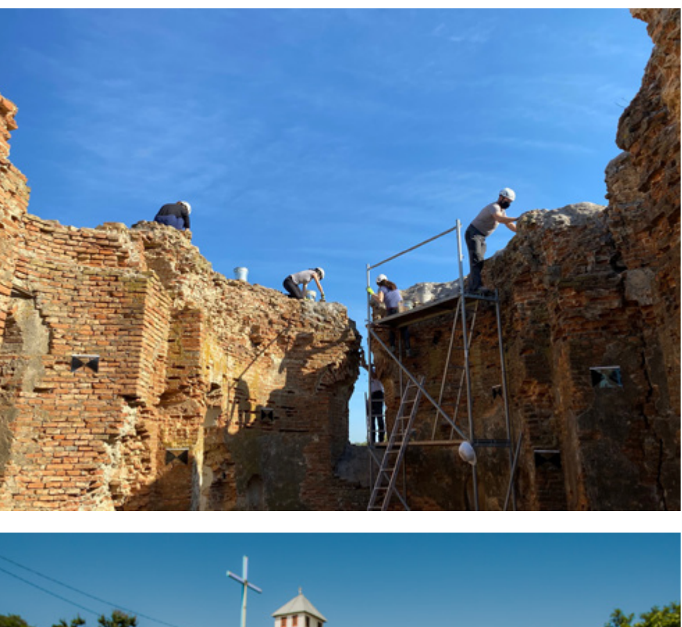
Intervention on Vovidenia Church ruin, Iași county, 2020 (Asociația Actum)