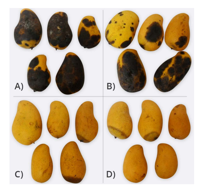
Figure 2. Anthracnose severity after 20-day storage at room temperature ( 20 \pm 2 °C) in 'Ataulfo' mango inoculated with Colletotrichum spp.: A) Control (56.2 %), B) Pichia guilliermondii MZC (37.3%), C) HT (3.2%), D) HT + Candida quercitrusa 42 (1.8 %). HT: Hydrothermal treatment (46.1 °C for 70 min).

An inhibitory effect of anthracnose on mangoes treated with the MZC strain was observed (Figure 2B) with respect to control (Figure 2A), although statistically, the effect was the same. In the mangoes treated only with HT, and in those where HT was combined with antagonistic yeasts, we observed a better control