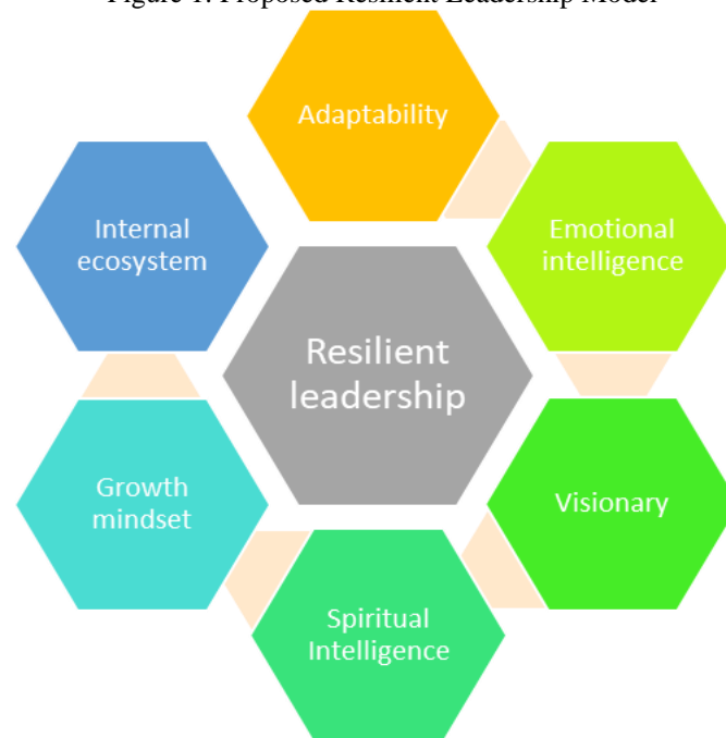
Figure 1: Proposed Resilient Leadership Model