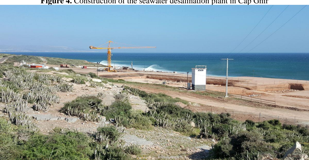
Figure 4. Construction of the seawater desalination plant in Cap Ghir

To overcome the lack of drinking water supply, the National office of electricity and water (NOEW) decided in 2014 to build a seawater desalination plant in Cap Ghir, 40 kilometers north of Agadir, with an estimated capacity of 100.000 m3 per day (expandable to 200.000 m<sup>3</sup>) in partnership with the Spanish company Abengoa. However, the project was subsequently found to be incompatible with environmental protection in a sensitive coastal area whose main purpose is the development of tourism. Indeed, the rural communes of Tamri, Taghazout and Aourir, which are home to world-renowned spots such as: La bouilloire, La Source, Mystery, Anchor Point and Banana, which generate thousands of overnight stays and employ about 2500 people in direct and indirect jobs, not to mention the businesses that live off this tourism (restaurants, grocery stores, surf stores, cabs, etc.), would be directly impacted. The discharge of brine, a concentrated solution of salt, will disrupt coastal ecosystems and disturb the quality of the water. This is in addition to the degradation of the landscape and the prohibition of access to the coastline for surfers.