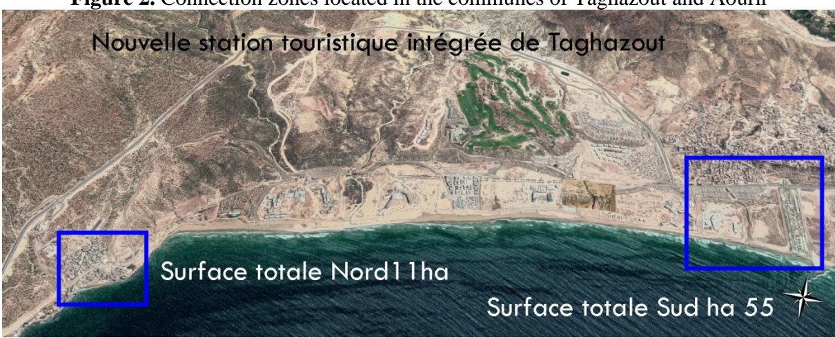
Figure 2. Connection zones located in the communes of Taghazout and Aourir