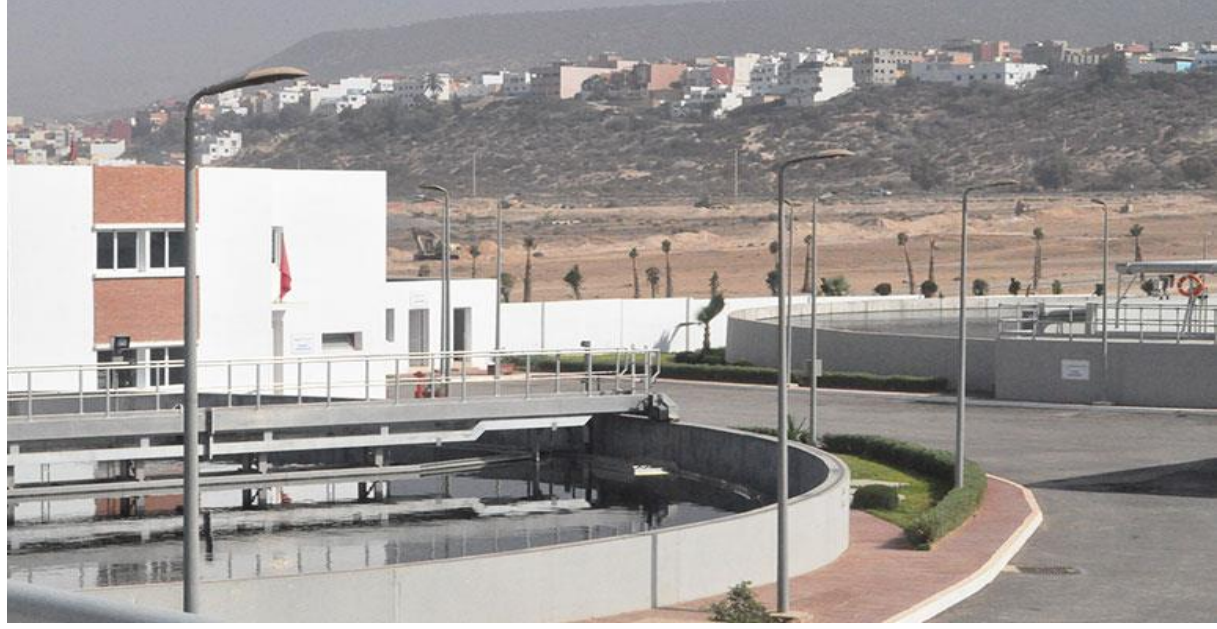
Figure 3. Aourir wastewater treatment plant