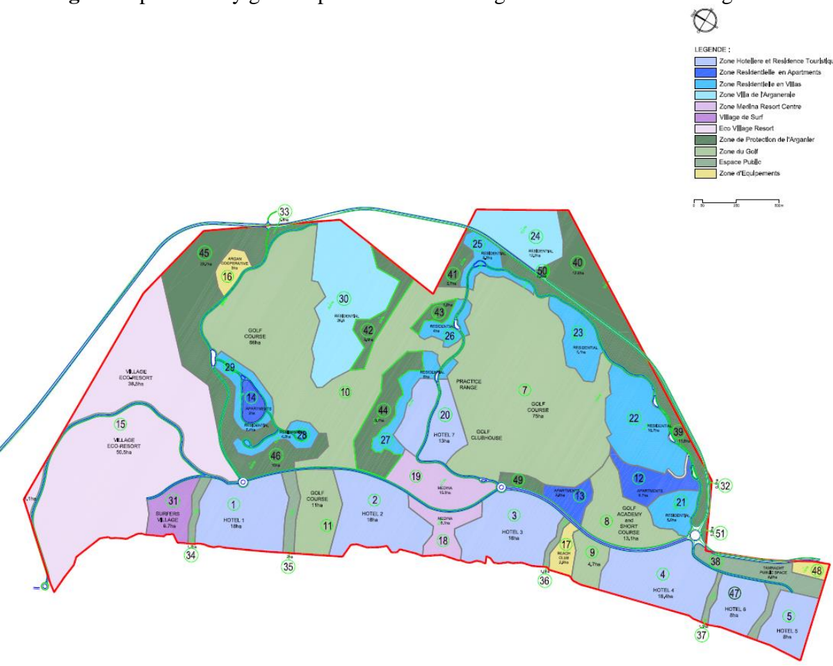
Figure 1. preliminary ground plan of the new integrated tourist resort of Taghazout