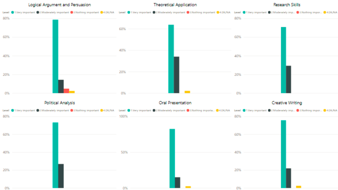
Figure. 2. Perception of the Importance of the Skills Exercised with Podcasting for the Performance of a Professional in Political Science Source: author created.

Additionally, the students highlighted some other useful competencies on a personal and professional level, based on their experience of creating the podcast (Figure 3). The perception of the participants in this aspect reveals that, despite how challenging it was to create their own podcasts; students identify several practical uses after this experience. In particular, they highlighted that this evaluation helped them to improve their ability to synthesize, while developing their creative and communication skills in the transmission of ideas. The integration of new knowledge and the management of technologies were other of the most outstanding elements on the part of the student body.