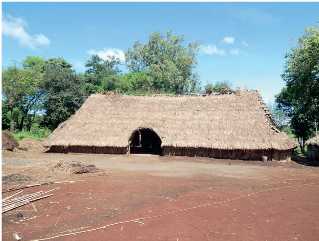
Image 2. Traditional family dwelling (now used primarily as a prayer house).

Dourados Reservation, Brazil, January 2020.