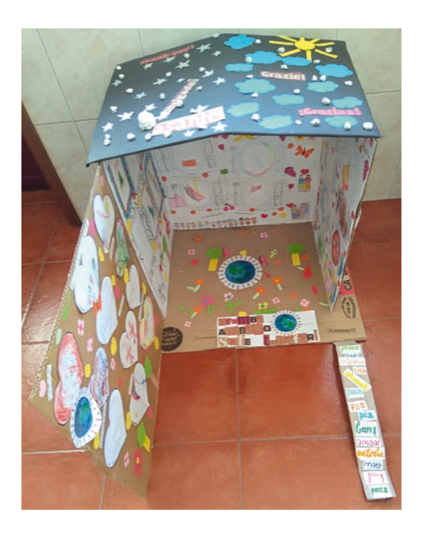
Figure 1. Our 'common home'

Phase 4, A house where we all fit!, comprised the following activities: playing games and watching multilingual videos in Spanish and Swahili (the mother tongues of Colombian and Tanzanian children), and decorating a cardboard house (Figure 1), a metaphor of planet Earth. Decoration was made by the children with all the drawings made during Phase 1, arts and crafts related to nature, as well as words written in the participants' languages. The roof of the house was covered by the sky and the stars on one side, depicting night; the sun and some clouds on the other side, picturing day; and a 'thank you' note in the languages used in the exchange. The 'common home' had no doors and was open to everyone. So, a bridge was built with the word 'peace' written in different languages, including Afrikaans, Bengali, Romani and Turkish, as a sign of respect to the people the sisters had met during their missions.