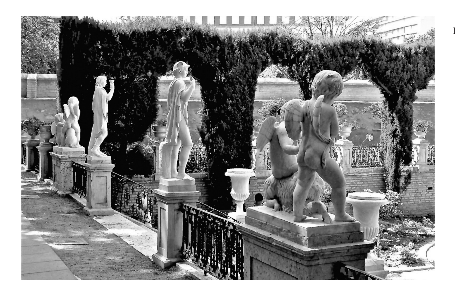
Fig 4. Historic evolution of the garden. From left to right and top to bottom: Plan drawing by Salvador Garameña Peris 1875 (source: catalogue of the exhibition Alamedas y Jardines en la Valencia del XIX, p.10). Plan with state previous to Javier Wynthuysen's intervention in 1942. Plan by Javier Wynthuysen 1950. Plan from the Archivo Histórico Municipal de Valencia (AHMV) 1972. Courtesy: Archivo Nicolau Primitiu, Biblioteca Valenciana. Current state garden plan of the Monforte Gardens showing the actual layout, main elements and features of the gardens. Source: Carlos L. Marcos (2020).