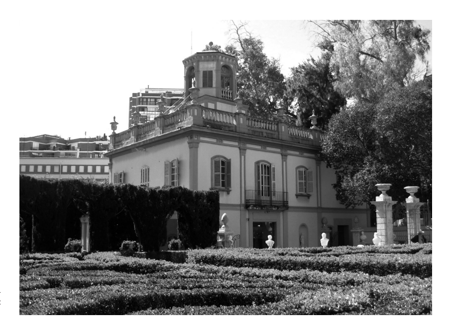
Fig. 1. Building designed by Sebastián Monleón.

The site was not far from the city so there was no need to construct a large building in accordance with his social position, just a place to rest or shelter during his escapes to the gardens<sup>19</sup>. For this purpose, he asked architect Sebastián Monleón Estellés –who is also attributed most of the design of the gardens- to project and build a rather small two-storey house to entertain his guests, lunch, rest and cool off while spending his days visiting the gardens (Figure 1). Monleón was undoubtedly one of the most active and relevant architects of his time in Valencia<sup>20</sup>. Compositionally, the house is based on a square floorplan, although it is elongated to absorb the irregularity of the plot resolved by a trapezoidal floorplan. It serves as the entrance and architectural filter into the premises. The main volume is crowned by a miramar<sup>21</sup>. As Ruiz de Lacanal's study has shown, the miramar or "watchtower", although common in Valencia, was not an exclusively local architectural feature<sup>22</sup>.