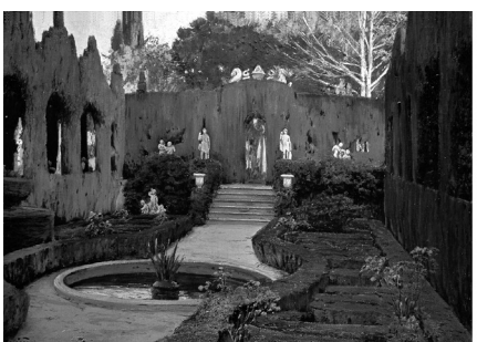
Fig. 3. Painting by Santiago Rusiñol i Prats, Jardines de Monforte, 1917 (public domain). Monumental gate in the distance, fountains and sculptures preceding it seen from the porch of the house. This gate articulates the transition from the geometric garden to the picturesque section.