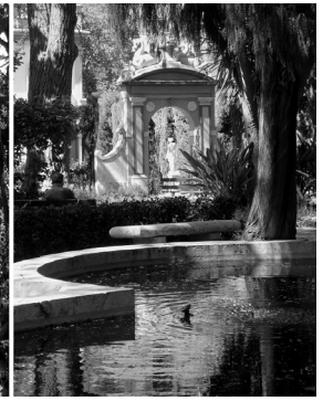
Fig. 5. (Left to right) The Grand Avenue paved with stone and gravel which runs from one side to the other of the gardens. Berceau running along the northwest wall of the Garden. Pond and monumental porticoed gate closing the perspective.

painting also evidences that this current fine and complex perspective that can be enjoyed from the porch through the porticoed gate in the distance is part of a transformation of the original conception. The gate was most likely added after the Civil War by landscaper and painter Winthuysen as it is in his plan where it is first appears represented (Figure 2). This addition may be considered the counterpart of the original gate flanked by two lions<sup>30</sup> that materialises the limit