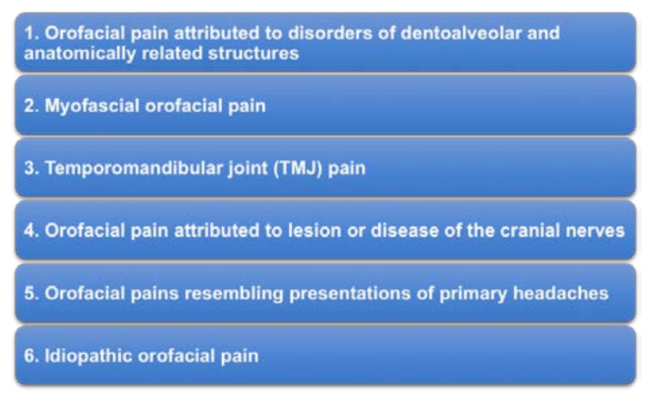
Figure 2. The International Classification of Orofacial Pain six chapters.

By unifying a new pain definition and to adopt a new clinical classification of pain, the first expected effect will be open minds within the clinicians. Everybody will be more careful when trying to explain what pain is, as well as when the patient was what is the source and name of his/ her painful condition.