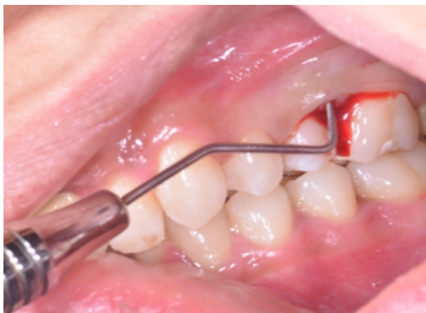
Figure 2. Pocket depth of more than 15mm.

The patient was detailed about the four likely solutions to her problem: