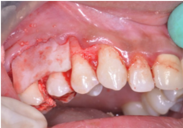
Figure 5. Membrane placed over the graft.