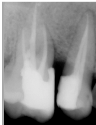
Figure 9. 5-year follow-up.