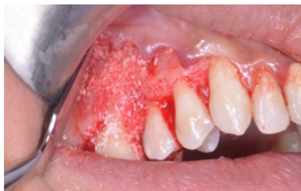
Figure 4. Bone allograft powder condensed.