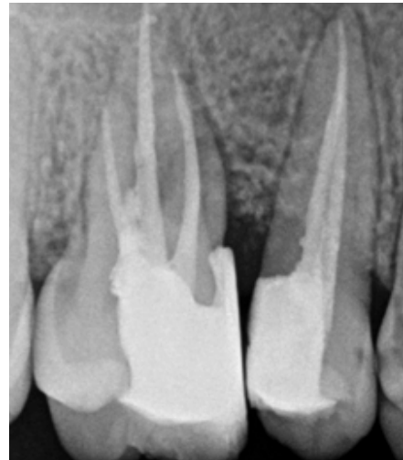
Figure 8. 2-year follow up.