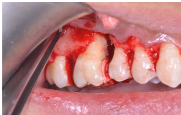
Figure 3. Bony defect exposed.

Matrix Membrane (Surederm) was placed over the graft area to prevent the epithelial cell migration (Figure 5). Finally, interrupted silk (4/0) suture were placed to approximate the soft tissue (Figure 6). Post-operative instructions were given and patient was directed to use chlorhexidine gel and rinse three times for a period of 15 days and suitable antibiotics were prescribed for five days. As the prognosis of tooth was highly questionable patient was recalled on follow up after 1 week, 2 weeks and 4 weeks. After 3-months' patient's intraoral radiograph showed remarkable improvement in regard to bone repair and patient's satisfaction (Figure 7). Clinical evaluation on 3-month, 2-year and 5-year recall exhibited marked reduction in pocket depth up to 12mm with radiographic evidence of further hard tissue repair (Figure 8). A 5-year recall showed a stable probing depth of 3 mm with functionally standing in her oral cavity despite the fact that she refused to have a crown on the treated tooth (Figure 9).