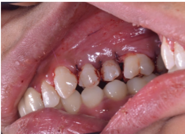
Figure 6. Interrupted silk suture placed.