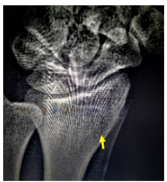
Figure 2. Crack line located in the distal part of the radius (arrow).