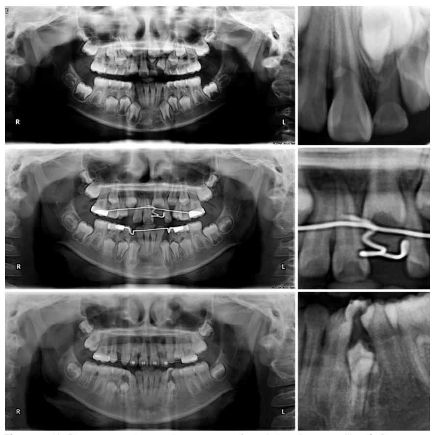
Figure 1 . (A, B) 8 years and 7 months, presence of mesiodens in premaxilla. (C, D) 9 years, traction of the permanent left central incisor. (E, F) 10 years and 5 months, 2 x 4 appliance and initial calcifications of mandibular supernumerary premolars.

When the patient was entering adolescence (12 years and 10 months old), brackets were bonded in all permanent teeth, and new radiographic studies were requested. The orthopantomography made evident the development of multiple