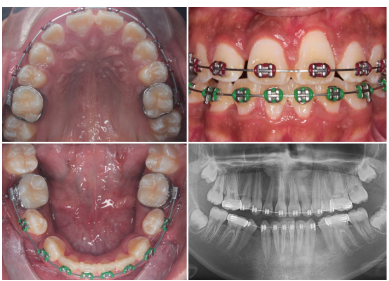
Figure 5. (A-D) Photographic and radiographic records revealing a progressive bone healing of the premolar zone bilaterally.