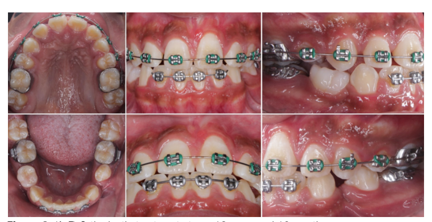
Figure 2. (A-F) Orthodontic treatment at age 12 years and 10 months.

dental germs in the mandible, and a Computed Tomography confirmed the initial formation of two supernumerary mandibular premolars in the right side and another three dental follicles at the left side (Figures 2 and 3).