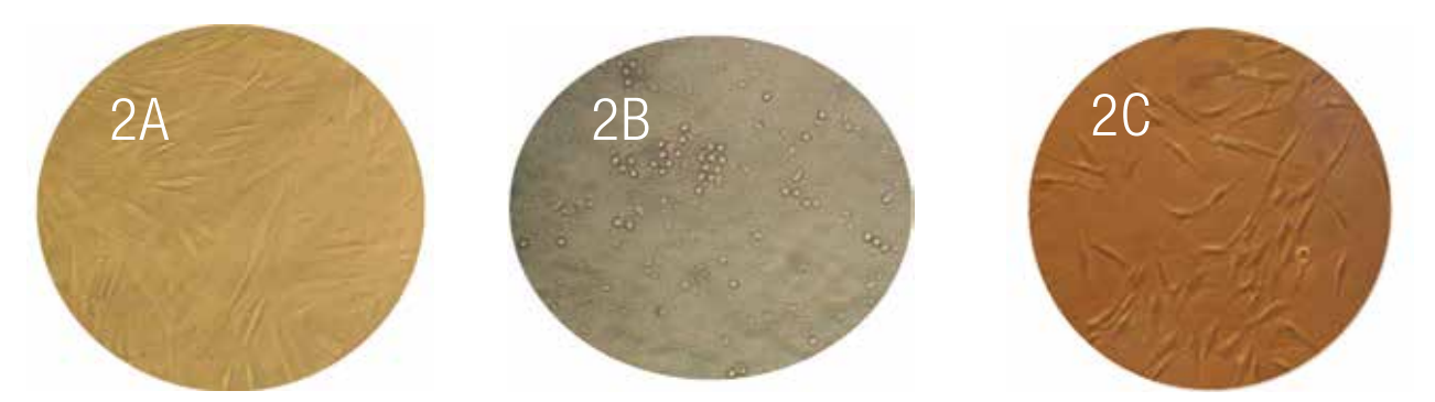
Figure 2. A. PDL cell culture lin physiological medium shows elongated shape named usually in international literature as fibroblast-like morphology. B. PDL cell culture in saliva showed the loss of usual morphology turning spherical. C. PDL cell culture in milk displays otimal physiological morphology