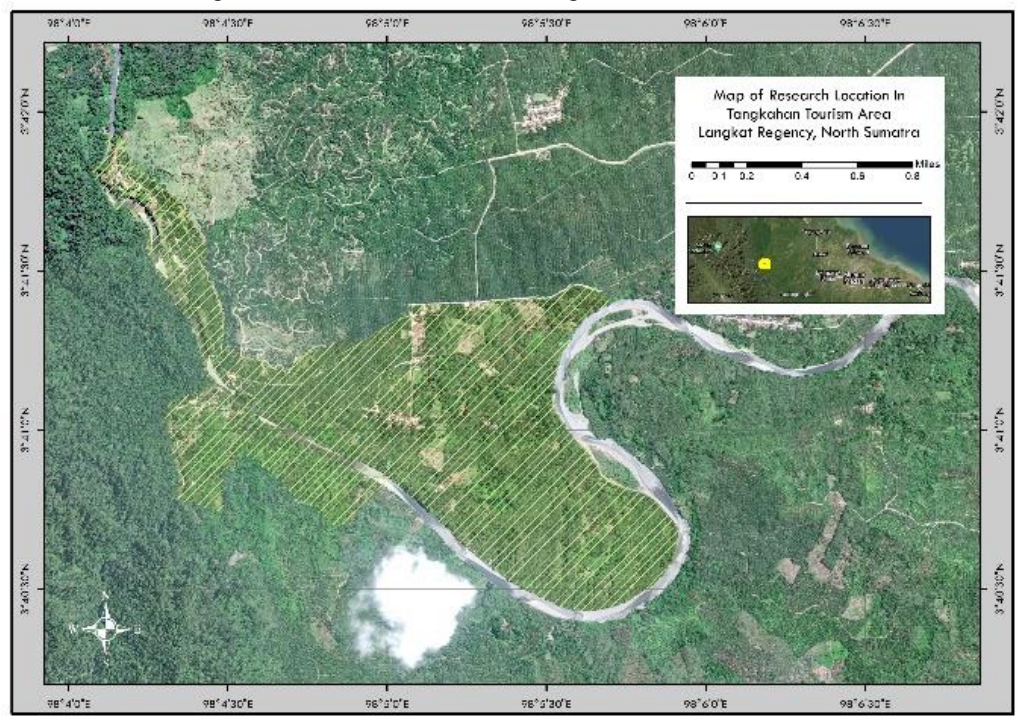
Figure 1. Research Location in Tangkahan Ecotourism Area

This research was conducted in the Tangkahan Ecotourism Area, Gunung Leuser National Park, Langkat Regency, North Sumatra. Administratively, Tangkahan is included in the Batang Serangan District, precisely in the villages of Namo Sialang and Sei Serdang. This research was carried out in December 2019 – April 2020. The development of this area refers to the Minister of Forestry Regulation No: P.19/Menhut–II/2004 concerning Collaborative Management of Nature Reserve Areas and Nature Conservation Areas. Geographically, the Tangkahan ecotourism area is located at 3°05'30" North Latitude and 98°04'26.8" East Longitude. Tangkahan is an area on the border of Gunung Leuser National Park (TNGL) in North Sumatra. This location is at an altitude of 130-200 meters above sea level.