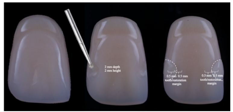
Figure 1 . Representative image of class III preparations, and color acquisition. Two different color measurements were performed: 0.5mm away from the tooth/restoration margin for each restoration and tooth.

There were no significant differences between materials and scores in the A1 and A3 shade groups (p>0.05). There were statistically significant differences between the materials and the scores in the A2 shade groups (p<0.05). The highest "0" score was seen in the VU group (33.3%), and the highest "1" score was observed in the O (91.7%) and EA (91.7%) groups.