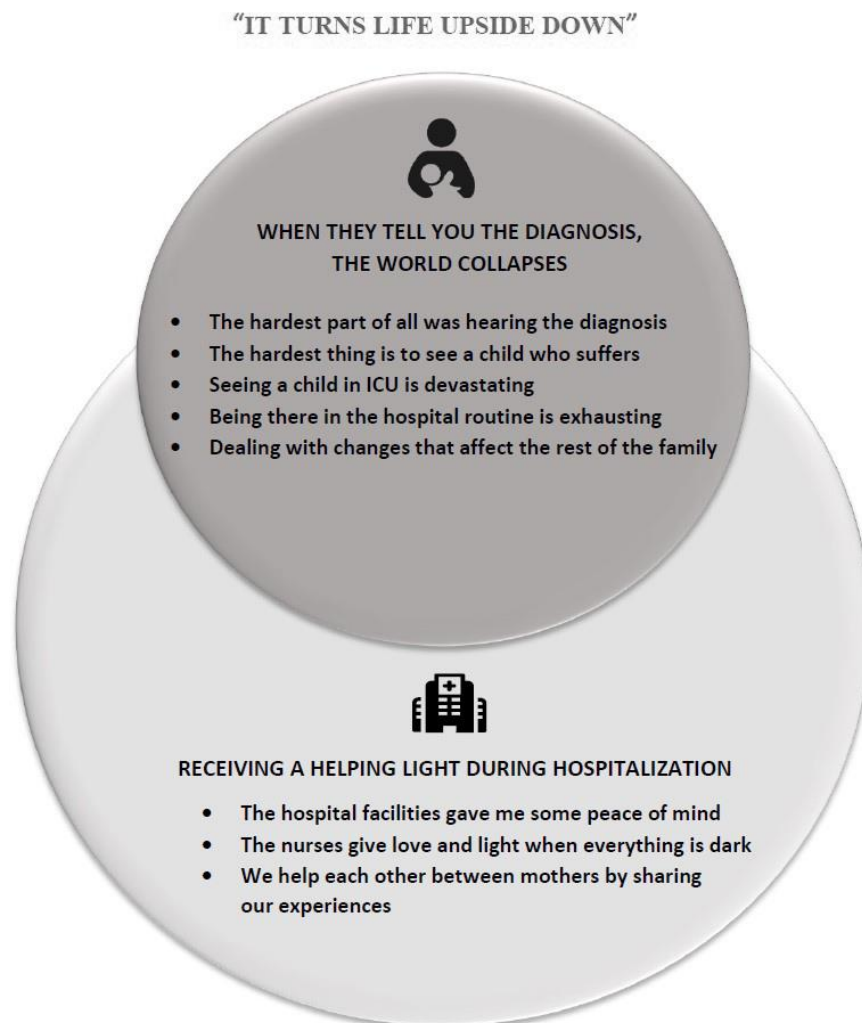
Figure 2. Thematic structures of the experience lived by parents of children hospitalized in an oncology unit.

Figure 2 shows the main structure of the results, and it is titled “It turns life upside down”. It contains 2 secondary structures: “when they tell you the diagnosis, the world collapses” and “receiving a helping light during hospitalization”. The first structure brings together the difficult experiences that mothers and fathers live in caring for their child during hospitalization, and these meanings are grouped into 5 thematic substructures that narrate complex moments such as “the hardest part of all was hearing the diagnosis”, “the hardest thing is to see a child who suffers” and “seeing a child in ICU is devastating”. This structure also contains the personal impact of hospitalization which is shown in “being there in the hospital routine is exhausting” and “dealing with changes that affect the rest of the family”. The second structure is positioned behind and in contact with the first one, since it was observed as an element that appeared simultaneously with the difficult moments narrated by the participants and it is entitled “receiving a helping light during hospitalization”. This second structure contains 3 substructures that were “the hospital facilities gave me peace of mind”, “the nurses give love and light when everything is dark” and “we help each other between mothers by sharing our experiences”.