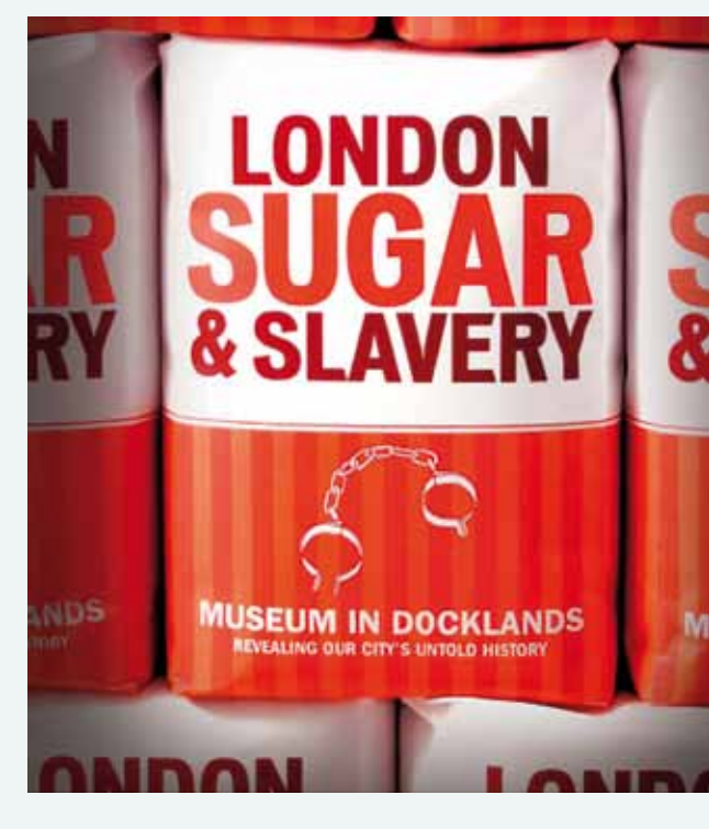
▲ BROCHURE launched along with the exhibition. Downloadable from: http://www.museumindocklands. org.uk/English/EventsExhibitions/Special/LSS/

Once you reach the main gallery the exhibition becomes a collage of objects, posters and