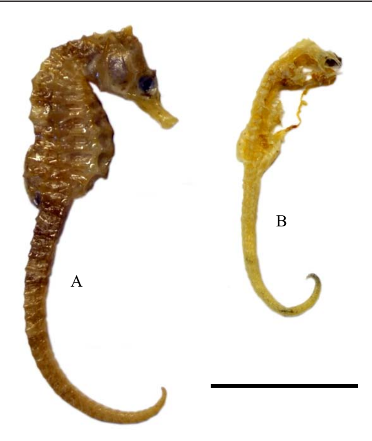
Figure 2. Measurable individuals of Hippocampus patagonicus obtained from the stomach of Mustelus schmitti . MMPEAA 36 (A) and MMPEAA 49 (B). Scale bar indicates 2 cm.

The record of patches of H. patagonicus at shallow and intermediate depths (0-20 m) along the coastal area of north Patagonia and Buenos Aires Province and its record at deep waters (60 m) in the Uruguayan and Argentine Common Fishing Zone (Luzzatto et al. 2012, 2014) indicated the presence of seahorses over a large depth range. Juvenile specimens of H. patagonicus drifting attached to floating debris or swimming freely may interconnect the patches and facilitate their ability to disperse to deep waters (Luzzatto et al. 2013). The record presented here together with that provided by Estalles et al. (2017) near Monte Hermoso allow to infer the presence of the species in an extended coastal area (Figure 1 B).