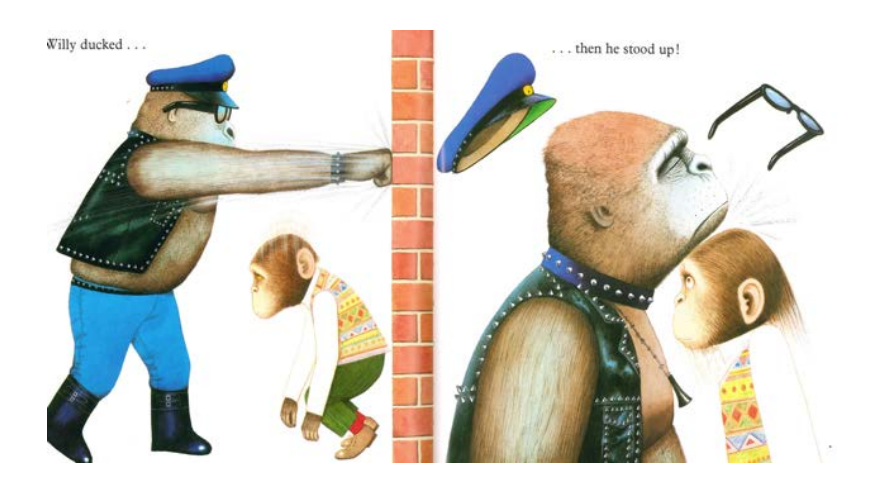
FIGURE 3. Buster Nose attacking Willy (Illustration from Willy The Champ by Anthony Browne. Copyright © Walker Books 2008)

As seems to be the transitive pattern in the picture books analysed so far, in The Purim Superhero , most of the double spreads are also transactional embedded images, combined in this case with verbal or communication processes, as the participants are usually depicted with their mouths open. This highlights the interaction that is established between Nate and his dads and his friends. In double spread 1, for example, Nate and Max, one of his mates at school, establish eye-line vectors in a transactional embedded image while they paint a mask and chat in a gesture of mutual understanding. In double spread 4, we observe Nate having dinner and commenting to one of his dads his dilemma between following his preference for dressing up as an alien or fitting in with the rest of the group and dressing up as a superhero. It is precisely when Nate interacts with his parents that