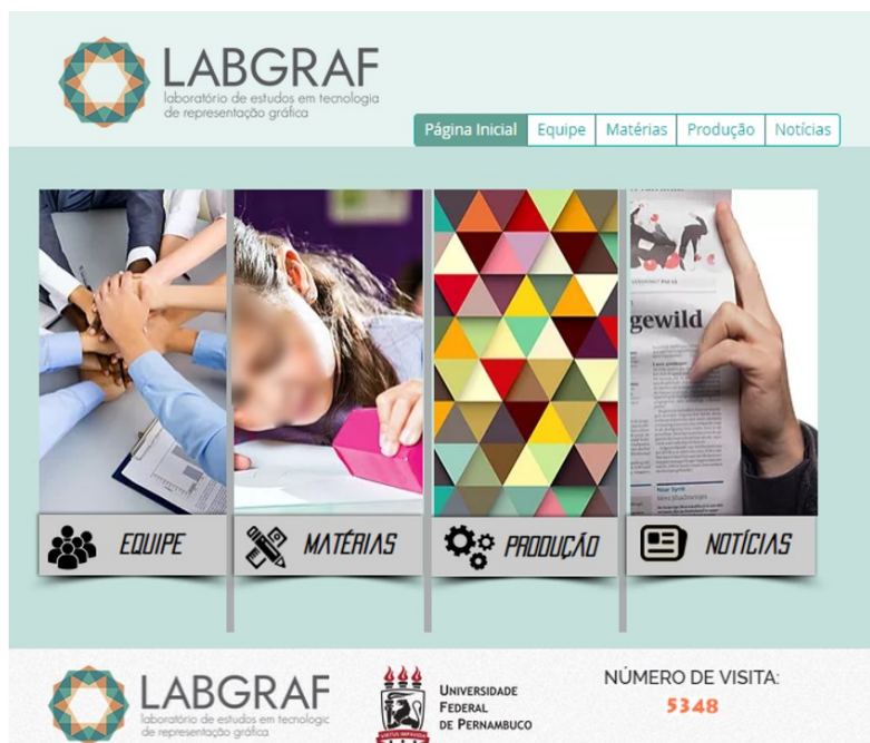
Figure 1. Labgraf Virtual Environment Interface.

Based on the research carried out by Fulgêncio (2019), it was found, among the main data, the need to adapt the discipline of Technical Drawing 4 to the Control and Automation Engineering course, as well as to extend the class time by a multimedia environment. In this sense, it was developed by the Laboratory of Technologies in Graphic Representation (Labgraf) a website with the contents (theoretical and practical) of the disciplines of graphic geometry of UFPE (Figure 1).