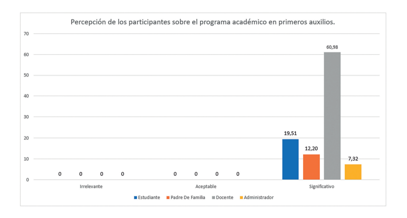
Figure 2. Perception of the participants about the academic program in first aid.