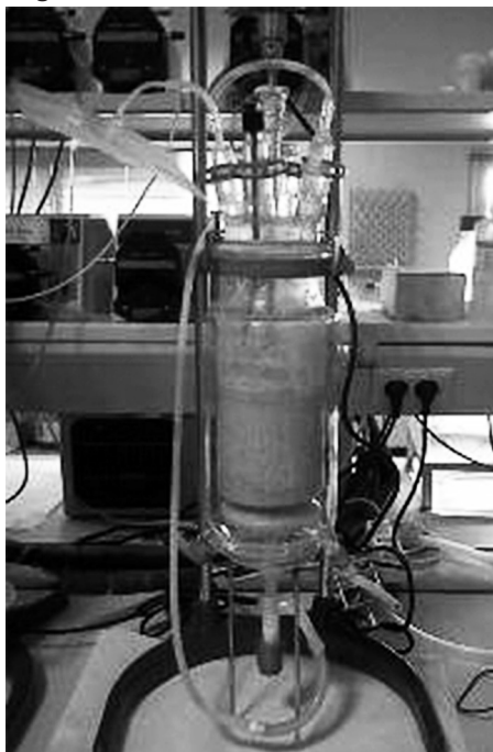
Figura 2. Bioreactor at UCLM

The protein production for human consumption research project was a qualitative investigation, and it began by using the information from solid waste production in Bogotá, continuing with its classification. The following step was to look for information about the valorization options for organic fraction treatment, and compile a lot of data about the compost process, the earthworm production and the protein production for human consumption. With all this information we analyzed the technical and economical feasibility of this process, taking into account weather conditions, temperature and humidity, as well as the technical and economical conditions in Latin America.