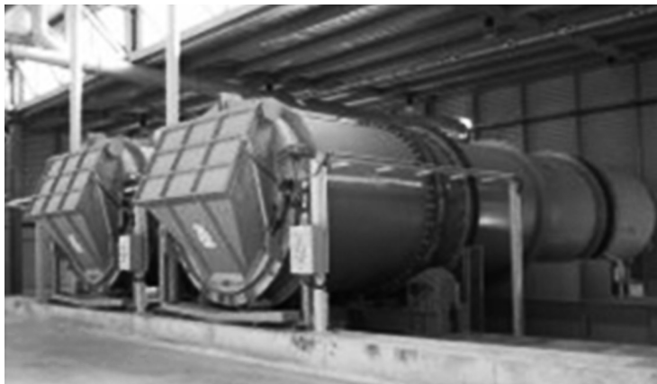
Figura 4. Compost equipment in Mallorga