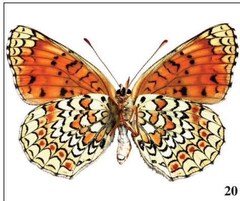
Figs 16-20. — 16. M. phoebe larva on Centaurea scabiosa Istria, Croatia, 27 July 2010. 17. M. ornata larva on Carduus collinus 2 km NW. of Rakitovec, Koper, Slovenia 30 April 2012. 18. M. phoebe male underside, 2 km S. of Rakitovec, Koper, Slovenia (captured 17 May 2011). 19. M. ornata female underside, circa 2 km NW. of Rakitovec, Koper, Slovenia (captured 17 May 2011). 20. M. phoebe ♂ x M. ornata ♀ female hybrid underside, reared ex M. ornata female from Rakitovec, Slovenia, emerged 17 May 2012.