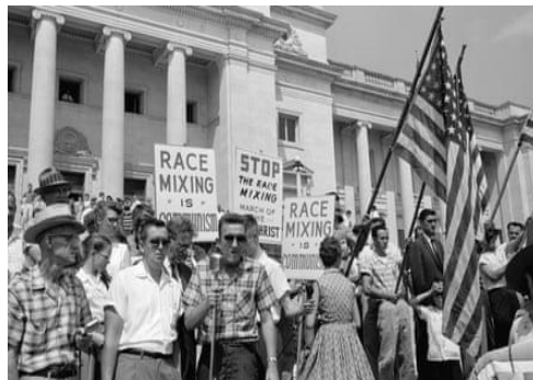
Figure 3: Protesters outside Central High, Little Rock Arkansas. In their posters they call for an end to the “mix of races”, stating that Integration would be a communist policy.

The situation in the state of Arkansas would only improve in the 1960s, however today it still requires a careful analysis and perception of the remnants influences of a dark time, when prejudice and division was what drove many of the nation’s leaders. In this sense, by understanding the context and analyzing these experiences, we hope to be able to answer the fundamental question that permeates this text: Is Integration a reality or is it a policy still in development?}