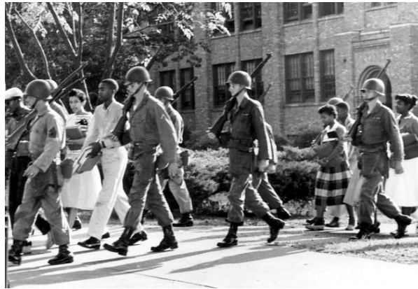
Figure 4: The “Nines de Central High” being escorted by the National Guard sent by President Eisenhower.

Through our text and the use of the archives of the Pryor Center, we have connected a perspective of Public History, as pointed out by Thomas Cauvin that highlights when pointing out the popular experience and participation in the conduct of these historical events. It is important to keep in mind that the practice of such events was not conditioned from the top down, but rather in the opposite direction, - since as it was the social outcry and the struggle for civil rights that brought about this change. Although somewhat superficial due to space, here we see the faces and voices behind the events that led to School Integration at Central High, albeit against the will and without the support of the Governor of Arkansas.