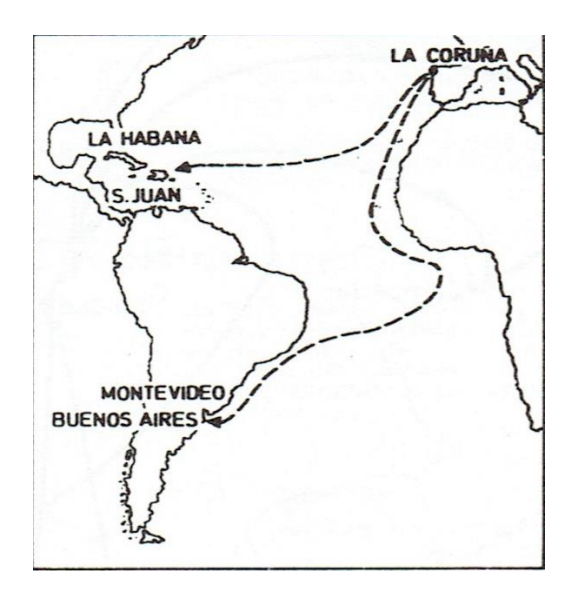
Figure 2. Itineraries for the postal service for the end of the 18<sup>th</sup> century.