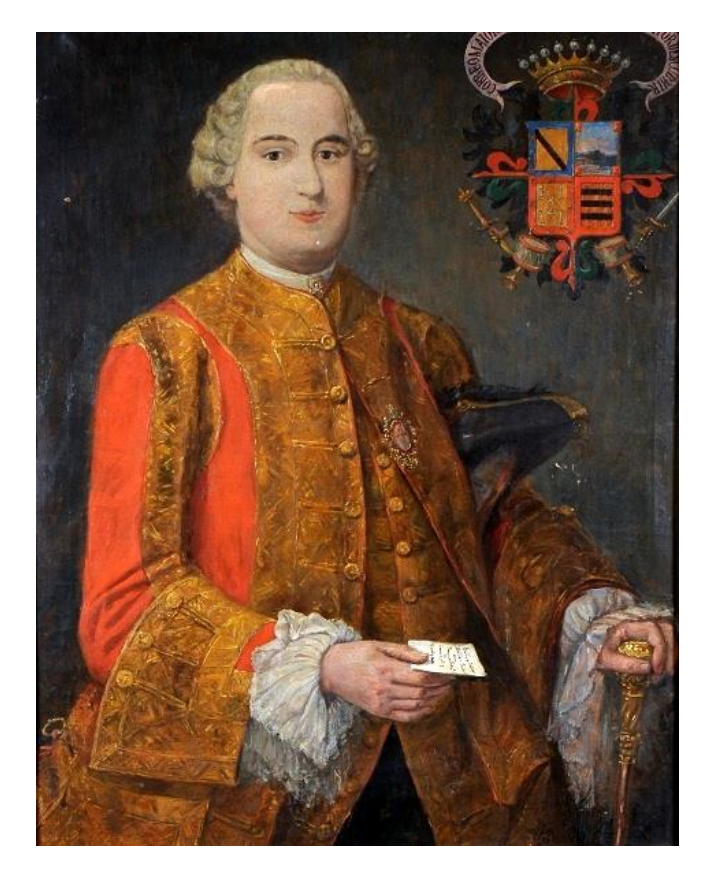
Figure 3. Portrait of Fermín Francisco de Carvajal Vargas y Alarcón, 18th century.

military importance, such as that of Mayor of Lima, Colonel of the Cavalry of the Royal Armies and Lieutenant General of the Cavalry of the Kingdom of Peru. They belonged to the Galindez de Carvajal family, which has held the title of Correo Mayor since the 16<sup>th</sup> century<sup>33</sup>. In this case, there is evidence of the close family and social networks with the function of the postal service, demonstrating that social dynamics and family structure were essential in imperial power structures. This is illustrated in the portrait of Fermín Francisco de Carvajal Vargas in which he appears dressed as an important figure of the Spanish American high society with a letter in his hand that reveals his function as Correo Mayor .