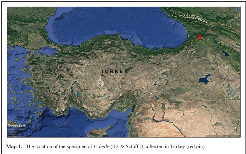
Map 1. – The location of the specimen of L. helle ([D. & Schiff.]) collected in Turkey (red pin).

A specimen of Lycaena helle species was collected in Posof district of Ardahan province in 17 July 2020 (Map 1). The specimen was collected during the TANAP (Trans-Anatolian Pipeline), project monitoring studies. The line transect method was employed in monitoring studies (Fig. 1). The specimen prepared in accordance with the museum methods is preserved in the Zoology Museum of Gazi University (ZMGU, Ankara, Turkey). Photographs of the dorsal and ventral wing of the specimen were taken with a Canon camera EOS 50D (Fig. 2).