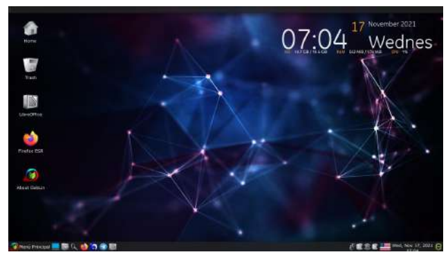
Figure. 3. User Desktop.

Minimum System Requirements for Installation: 64-bits processor, 2GB of RAM and 20GB of disk space. We want many more people to know and benefit from the features of this operating system. You can help by inviting others to visit the GobLin GNU/Linux website so that they can download it and use it on their computers. Download URL: https://sourceforge.net/projects/goblin-gnu-linux/