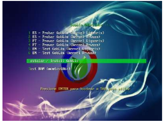
Figure. 1. Test/Install boot screen.

Once the computer boots, the user is shown the options to run the system in live mode or install it on a storage device in three languages of their choice: English, Spanish or Portuguese, as shown in Fig. 1. During the installation process, the status is indicated with a progress bar as shown in Fig. 2. And once the installation is finished, the computer restarts from the device where it was installed, and the user's desktop is displayed as is shown in Fig. 3.