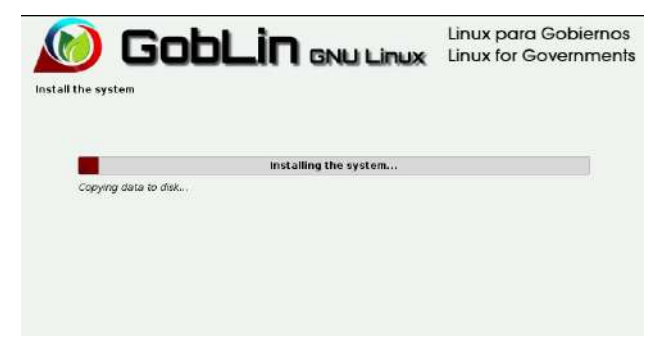
Figure. 2. Installation Process.