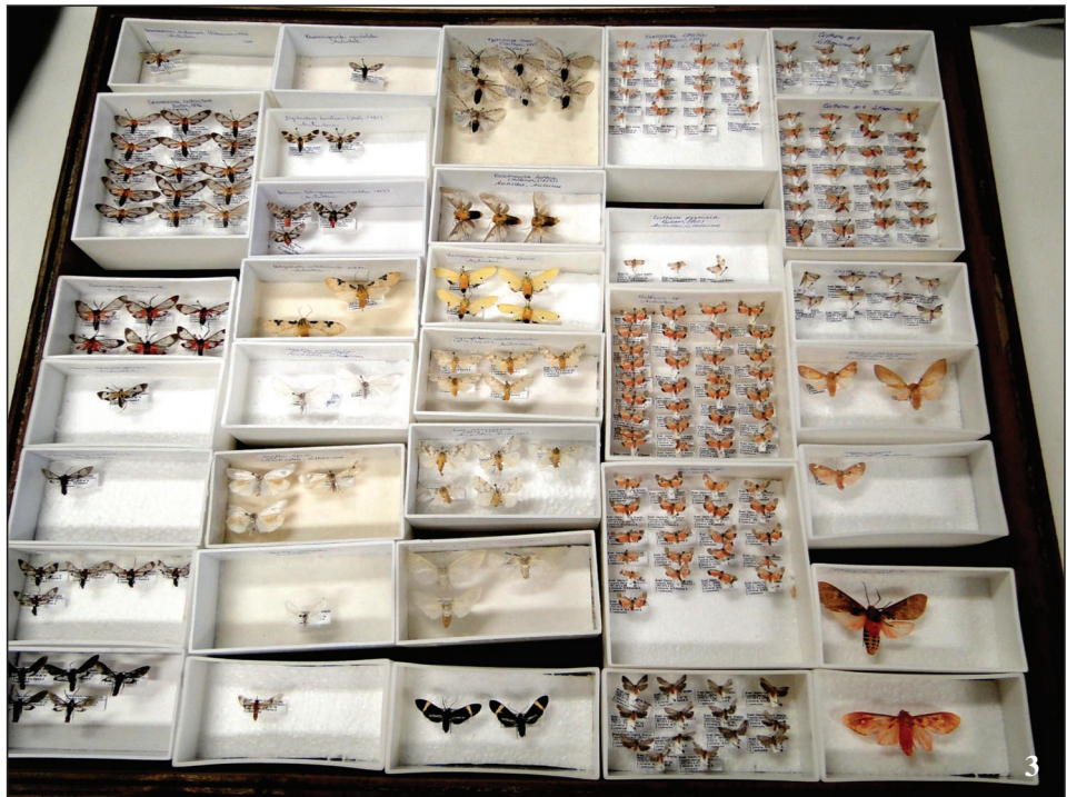
Figures 1-3. – 1. Illustrative diagram of the tent to be attached to the “Luiz de Queiroz” light trap. Illustration: Willer Bontempo. 2. The night tent-trap (NTT) used in the cerrado sensu stricto of Brasília, DF, for nocturnal Lepidoptera. 3. Some specimens of Lepidoptera collected with night tent-trap (NTT) in areas of Brazilian Cerrado.