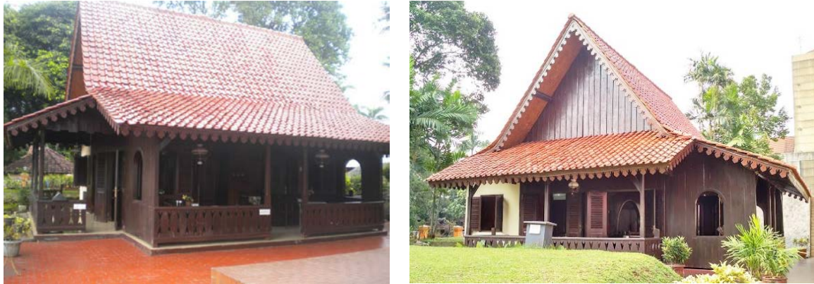
Figure 3: Kabaya House Designs

Another design is referred to the Joglo Betawi House. This design has the heavy influence from the Javanese architectures (Anak Betawi, 2016; Sintesiyyah, 2018). The roof design is the best-known feature that one can see the inspiration from the Javanese design. The main difference in the Joglo designs is evident in the main pillar structures to separate the rooms. In the Joglo Betawi design, which is commonly built around 64 squared-meter, the foundations of the main pillars are hidden.