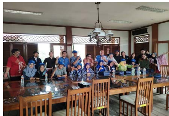
Some of the FGD Participants