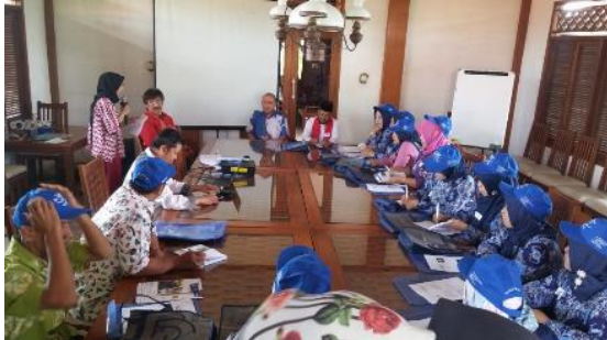
Some participants on FGD