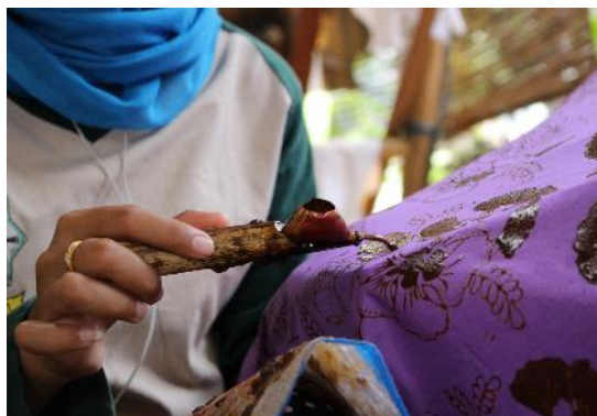
Arts (batik cloth)