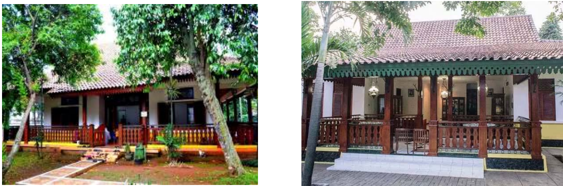
Figure 2: Gudang & Joglo Betawi House Designs Source: (Anak Betawi, 2016; Sintesiyyah, 2018)

In terms of the house designs (Scheffold et al., 2008), the Betawi culture has its own traditional blueprints, which is referred to as the gudang house as this design resembles a storehouse (Funo, Ferianto & Yamada, 2005). This design has a simple rectangular layout, extending from front to back, saddle-shaped roof. The structure generally consists of two-pieces of tilting press rods. This system is known as anderdan and is not found in other traditional houses in Indonesia. It is predicted that this was introduced by the Dutch. In the front of the gudang house, there is a piece of sloping overhanging roof that is also called a hat to block the sun and rain to the front-open-terrace (Funo, Ferianto & Yamada, 2005; Scheffold et al., 2008).