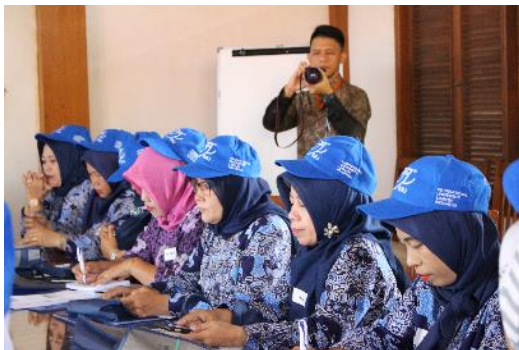
Some participants on FGD