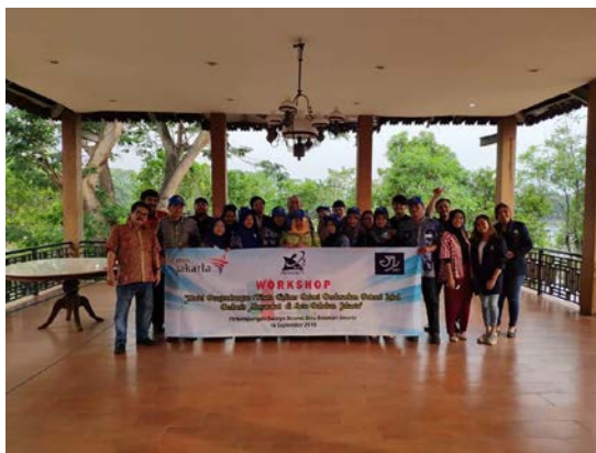
Some of the FGD Participants