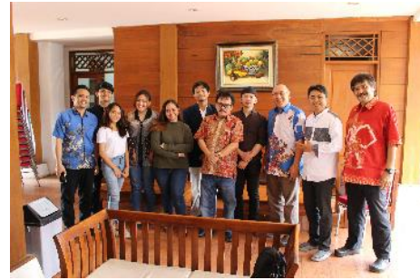
The organizing committee members on FGD